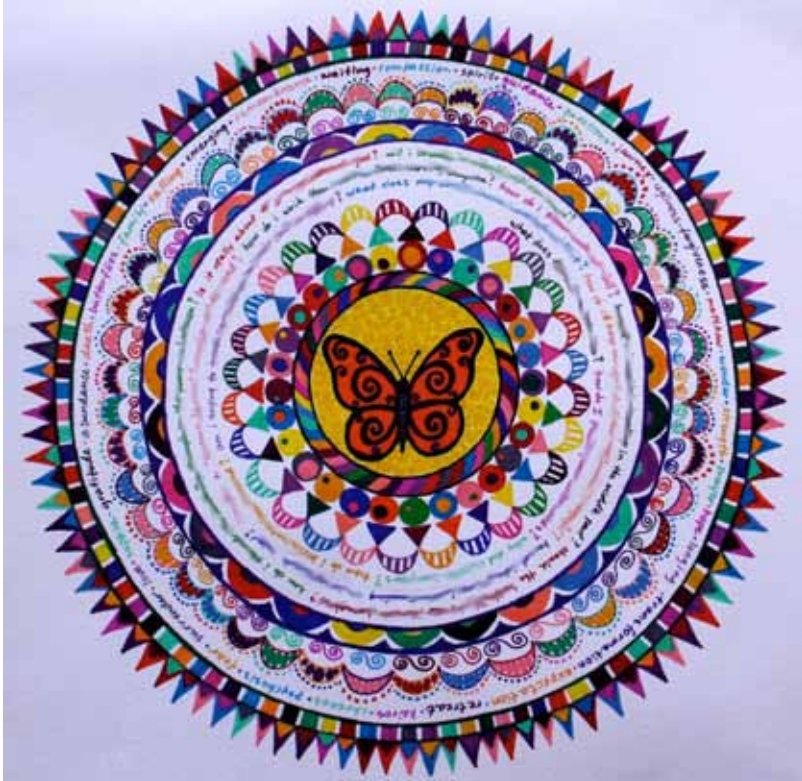
Artwork credit: Heather Plett