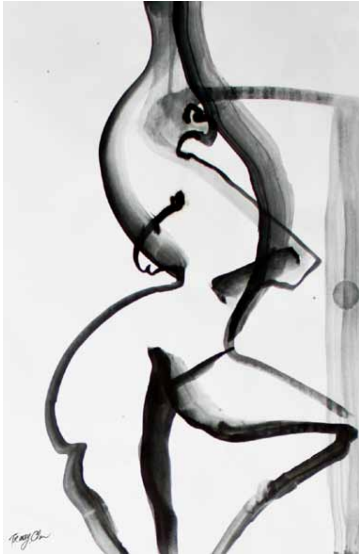
Artwork credit: Tracey Chan