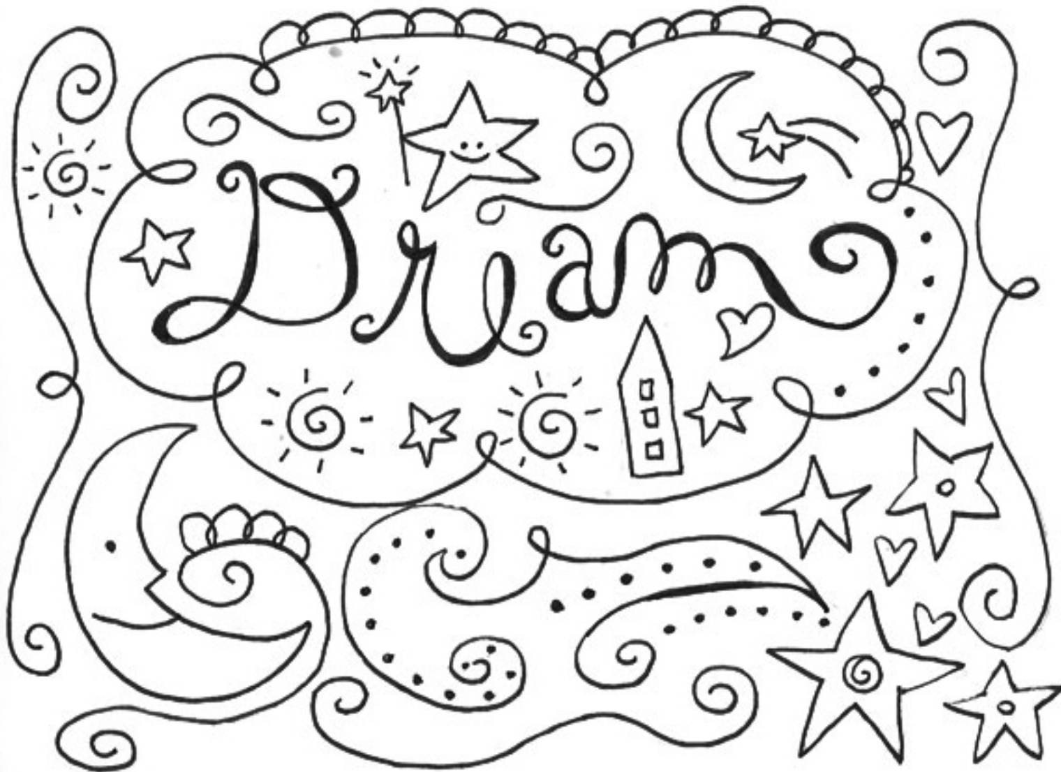
Artwork credit: Kimberly Schwede